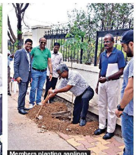
Members planting saplings