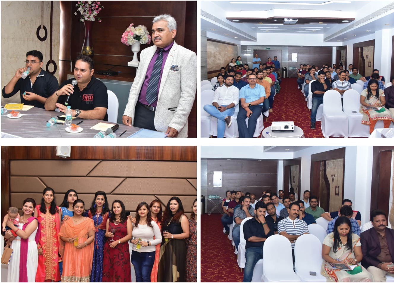
Nyati Elan-West II Society's first general body meeting was organised at Attica, The Corinthians Club & Resort. All the members came together to participate in the event and shared their experiences as well as their feedbacks.