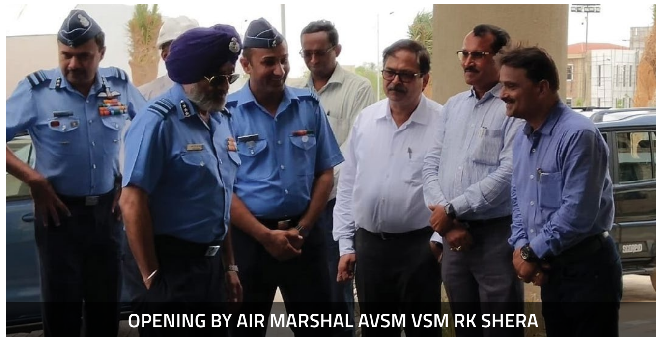
OPENING BY AIR MARSHAL AVSM VSM RK SHERA