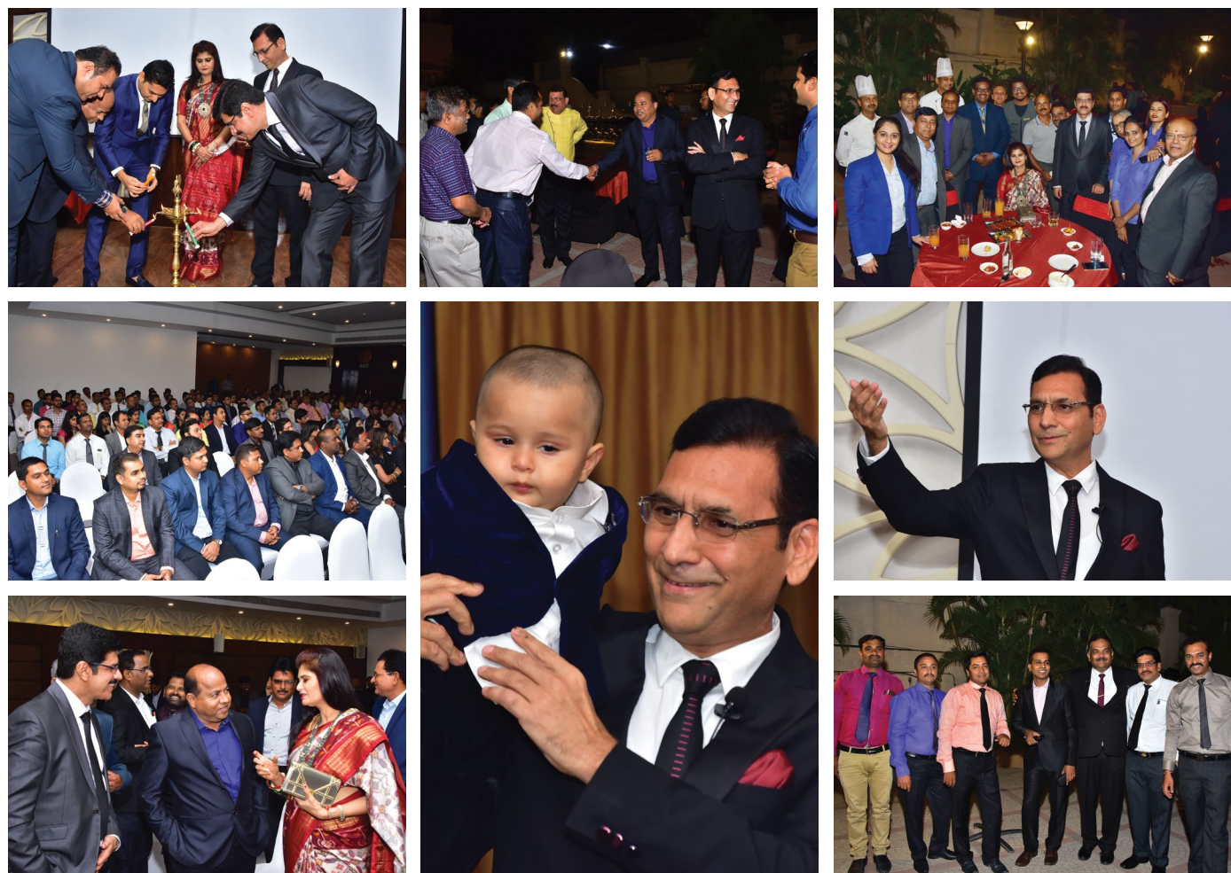
The 22nd Foundation Day ceremony was conducted and was received with great excitement from all the stakeholders of the Nyati Group.