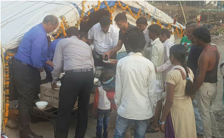
Corinthians team celebrated Gudi Padva with slum kids as part of Corinthians CSR initiatives.