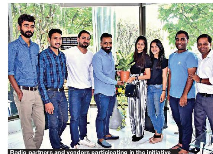
Radio partners and vendors participating in the initiative

keeping our spaces clean and green, while committing to take responsibility of each sapling for the next 10 years. I am grateful to our existing customers, vendors and partners who took the time out to join us on this noble venture, and I look forward to such events in future." The event was attended by the members of all the societies of the county.